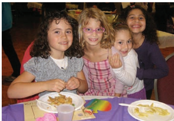
JCCP kids are all smiles at the Sukkot lunch in the social hall in early October.