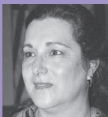
Orna Green Temple Sinai of Massapequa