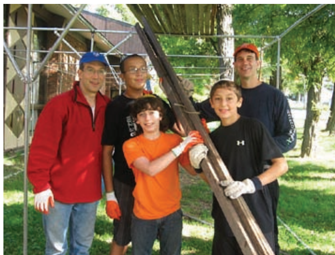
Adults and children have a hand in building the JCCP sukkah.